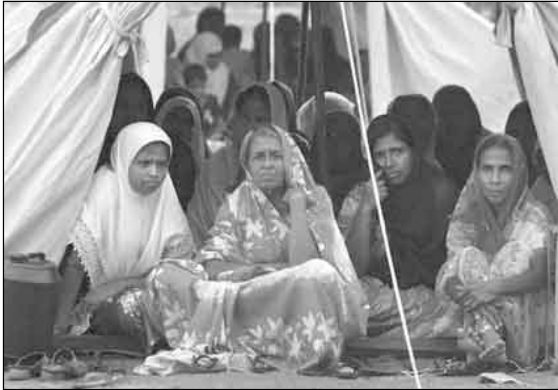
Tsunami victims find shelter in a refugee camp.

One country providing an alternative in positive disaster relief strategies and real solidarity is Cuba. In 2004 the people of the island of 11 million were able to confront two major successive hurricanes. While Hurricane Ivan and Charlie wrought havoc on the lives of equally poor Caribbean nations as well as the United States, Cuba was able to first evacuate 149,000 people during