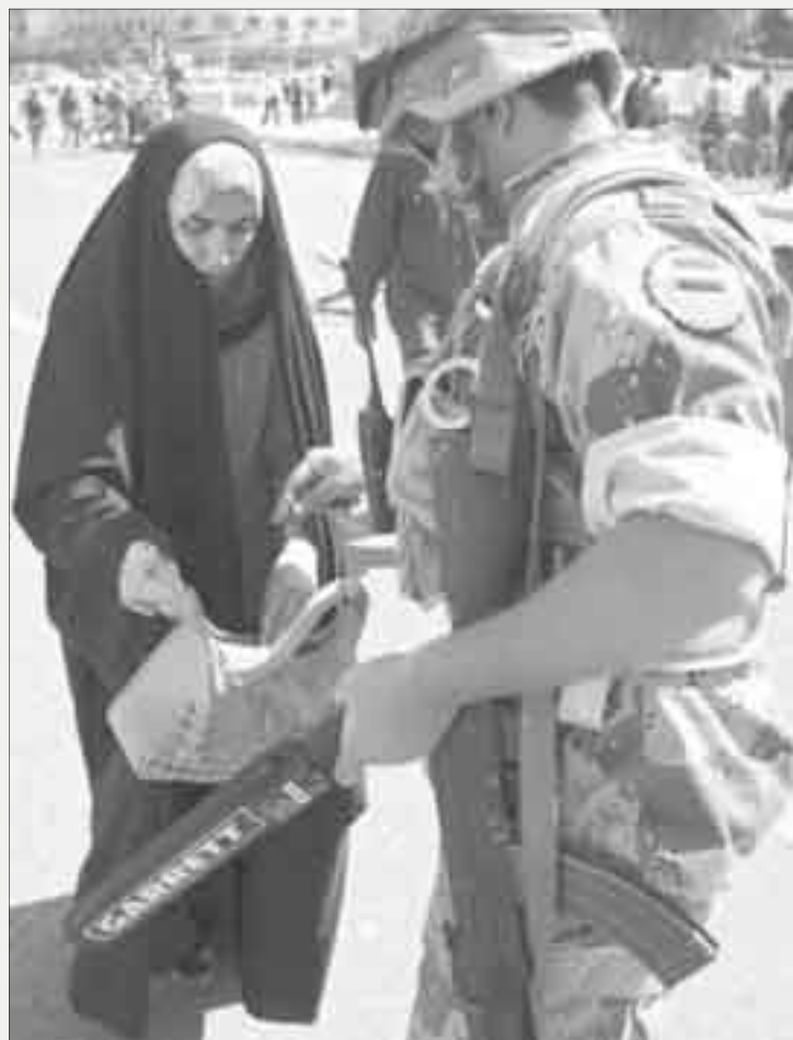
Iraqi National Guard searching Iraqi woman at a checkpoint March 16th, 2005.

When the words "corruption" and "loyalty" mean the refusal to support and work for the