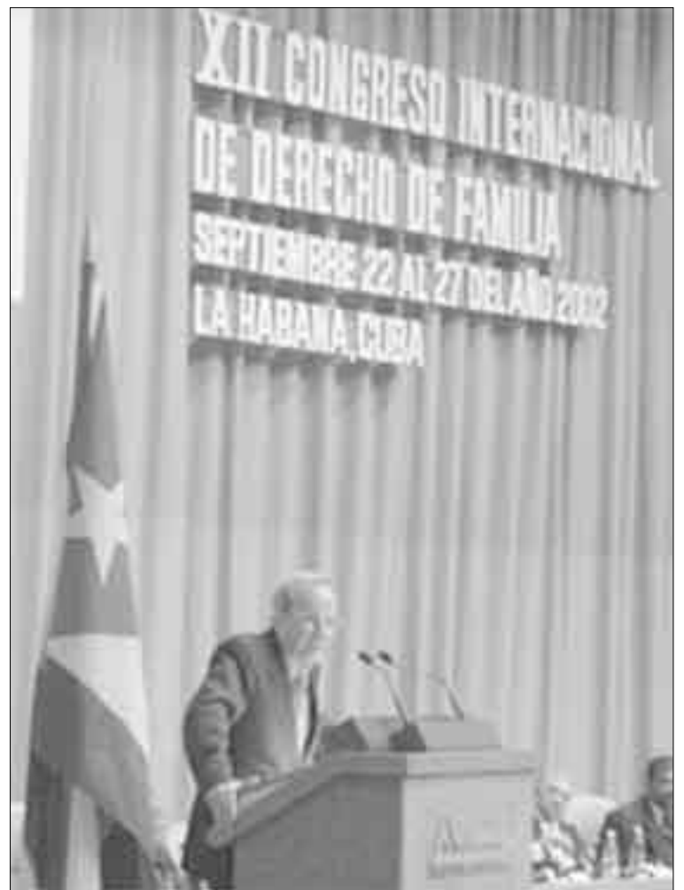
Ricardo Alarcon speaking in Havana, Cuba. September, 2002.

But more important, what is the meaning of this policy? It is