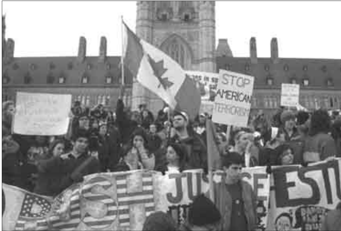
Protest against George W Bush in Ottawa, November 30th 2004.

Realistically, Bush's visit to Canada was not an infringement on Canadian sovereignty or the interests of the ruling class, but its purpose was to decide on what level Canada and the US can cooperate in their imperialist affairs. When the two leaders met to discuss the interests of the ruling elite it did not put working people in Canada in a position to defend their imperialist leader, nor their imperialist nation. Rather, it opened the opportunity to organize against imperialism in general, and against Canadian and US imperialism in