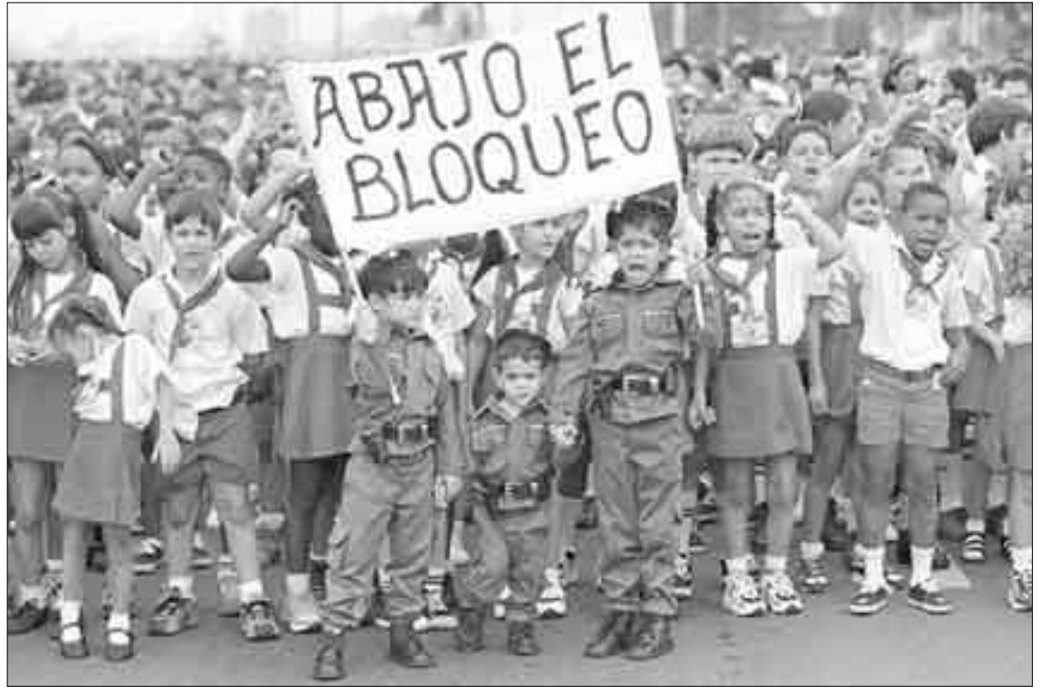
Young Cubans Rally Against the US Blockade.

otra ley que establecía sanciones para aquellos cubanos que trataran de implementar la Helms-Burton (por medio de la recepción de fondos, bienes y servicios de EE.UU. para apoyar públicamente la ley). Pero hay un principio legal al que los abogados se refieren como el