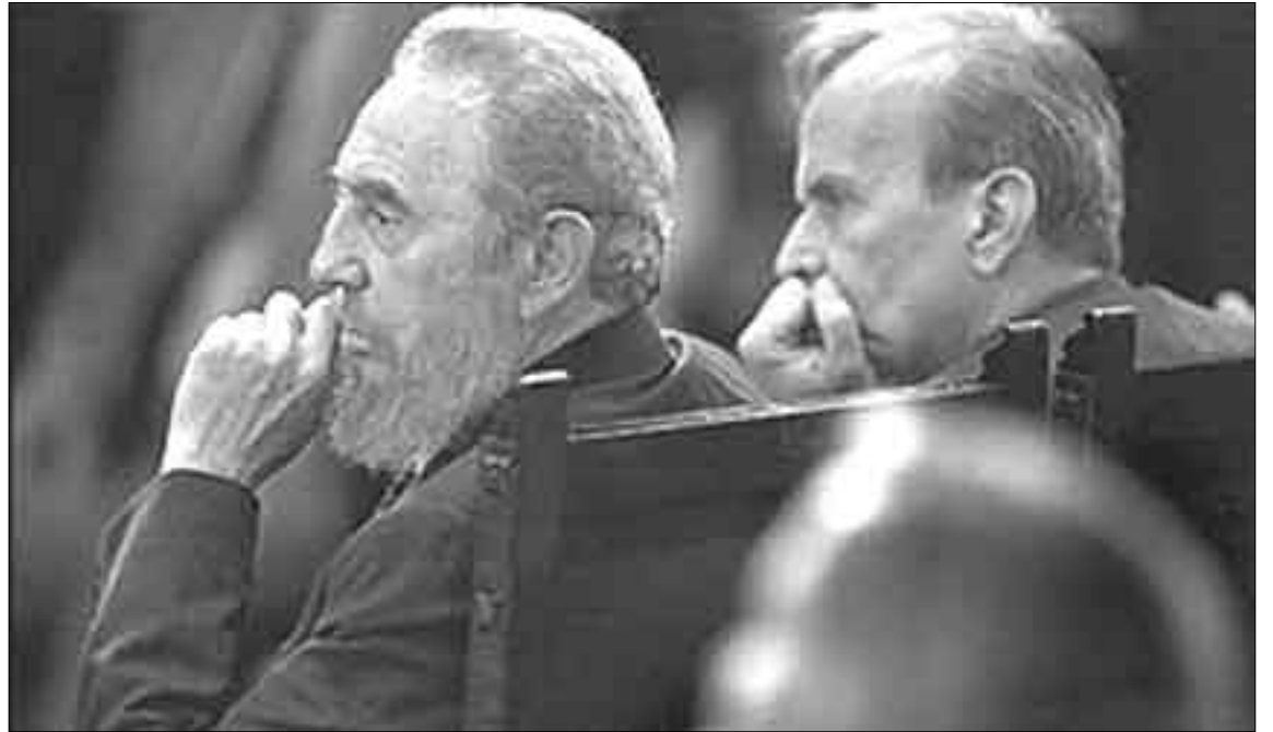
Fidel Castro Y Ricardo Alarcón.

Alarcón: La maquinaria de la propaganda norteamericana funciona muy bien en la manipulación de elecciones. Recuerdo a un grupo de legisladores norteamericanos tratando de desempeñar un papel para garantizar elecciones justas en Ucrania. ¿Recuerda las recientes elecciones protestadas allí? Al mismo tiempo, grupos en EEUU estaban exigiendo