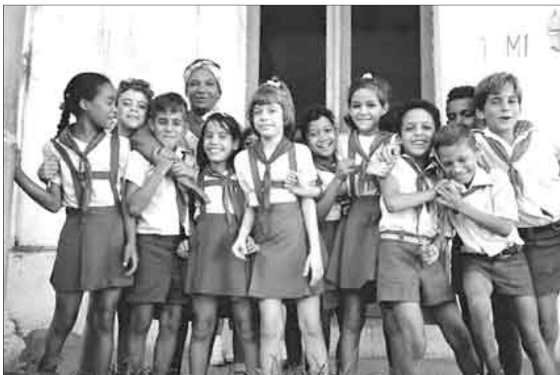
Cuban school children.