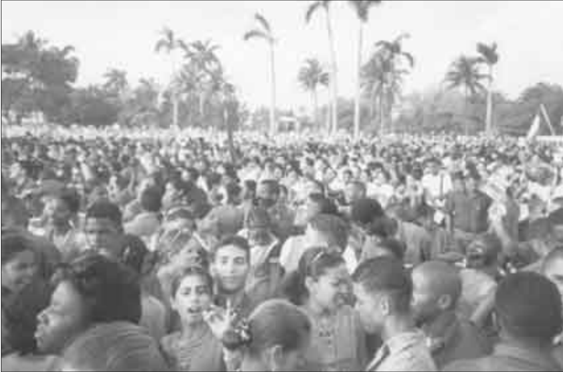
Cuban social workers at May Day demonstration in Havana.