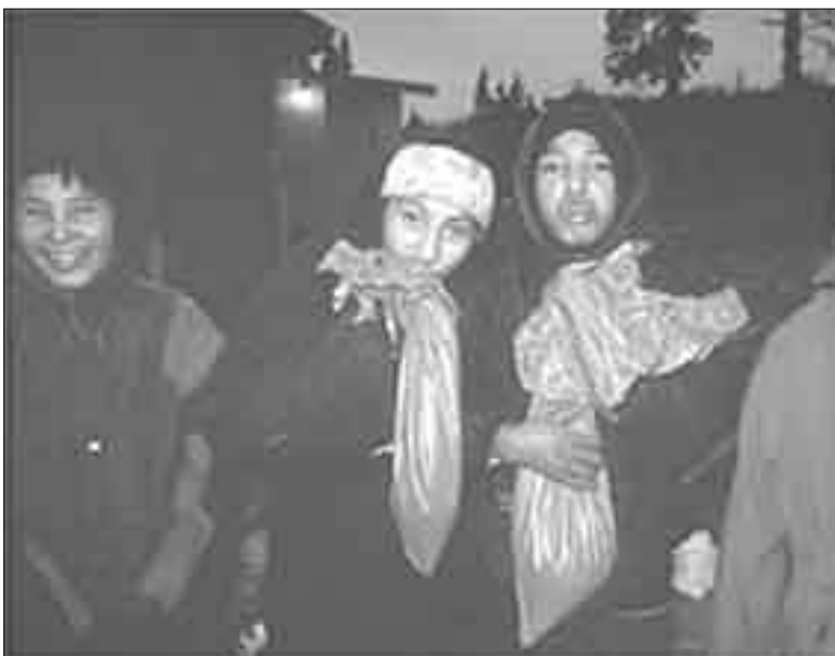
Innu youth huffing gas.

than non-Indigenous people, worse levels of access to healthcare and worse standards of living. Looking at education alone, in 2001, the drop-out rate among Indigenous youth in their early 20's was 50%, and those who stayed in school had a far less chance of graduating from post-secondary education. Much like the troubles affecting Innu youth, these are symptoms of colonialism. In order to move forward as people and as nations, we need to recognize that our interests do not lie with the government of Canada or its education system. The interests of Indigenous nations lie with themselves and all other people who are under attack by the same government. Demanding self-determination for Indigenous nations is a fundamental step forward to solve the problems of poverty, alienation and desperation that have been brought against Indigenous people for centuries.