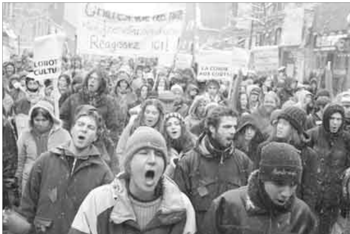
Student protest in Montreal, March 12th, 2005.

Based on the historic militancy of both the Quebecois sovereignty movement and the traditional leadership of young people in Quebec, students at Francophone colleges and universities swiftly took the front line position in the fight against the provincial government’s cuts. Throughout 2004 students