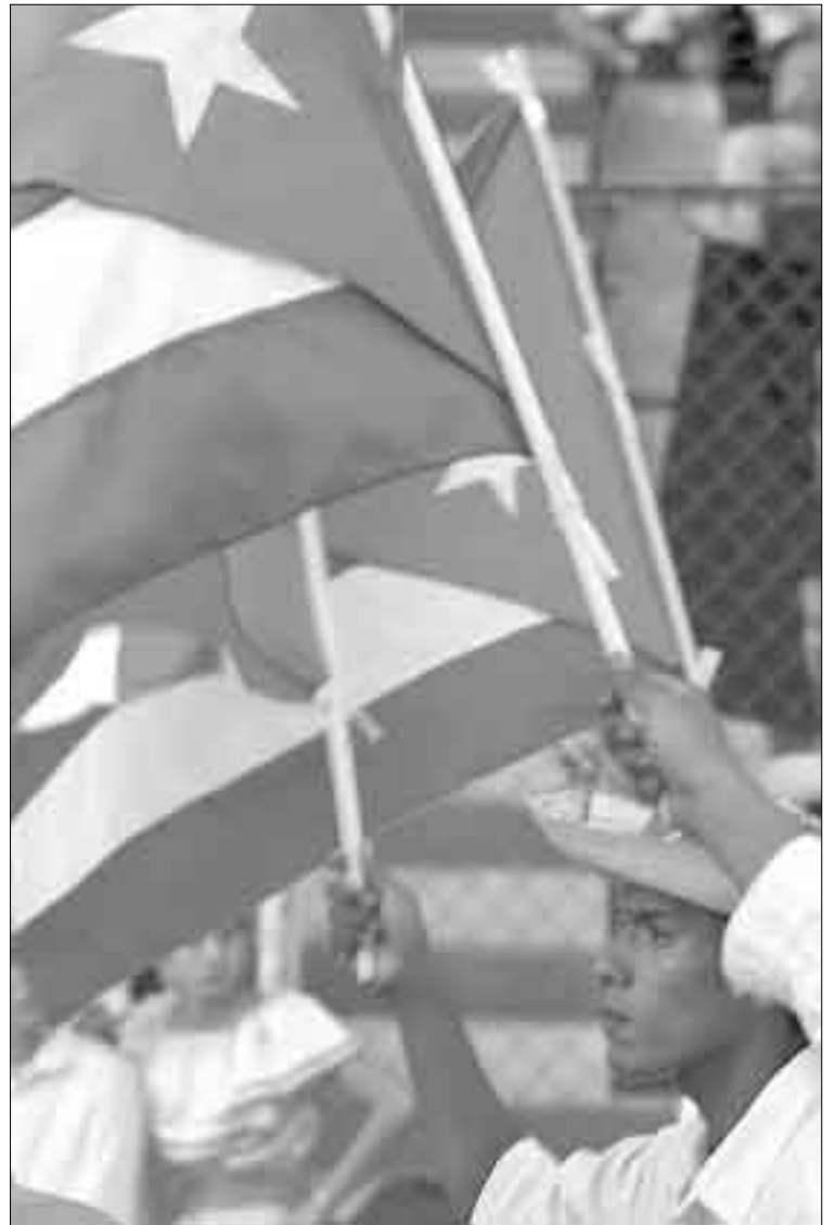
Bolivian youths rally in support of Cuba.

The defense lawyers called that the "necessity principle." Under certain circumstances an individual may violate a law to stop a greater threat or danger – the lesser evil philosophy. To