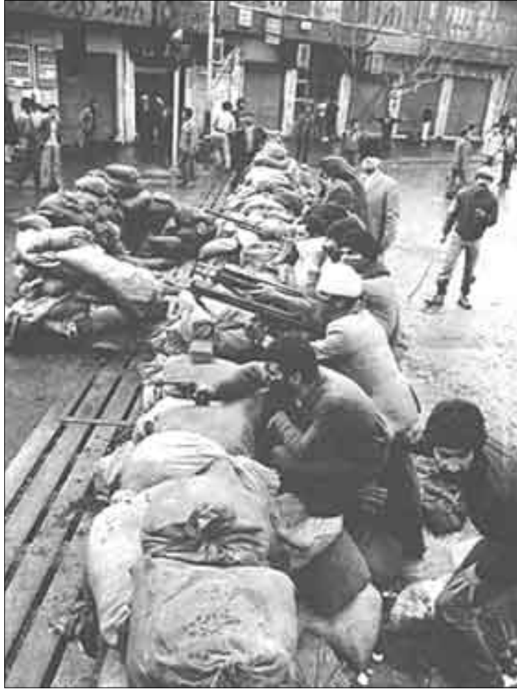
Barricades in the street of Tehran during the popular insurgency of February 11th 1979.

With the proposed sanctions and a possible US, EU and/or UN