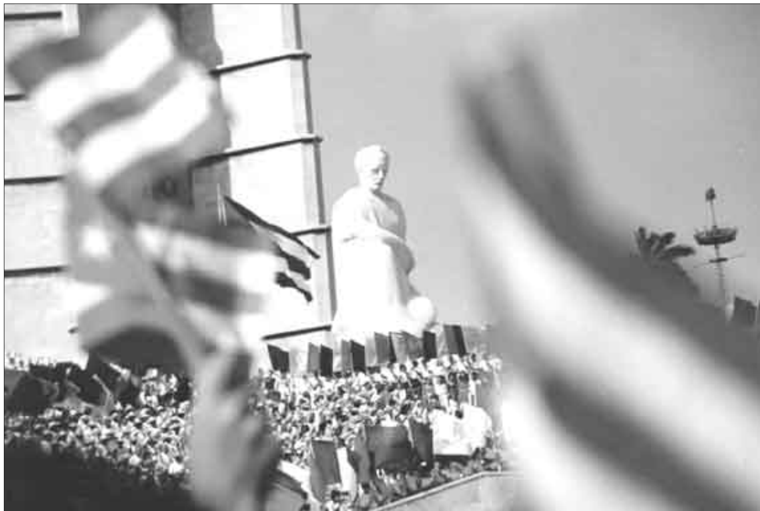
La estatua de José Martí en la Plaza de la Revolución, Habana.

a los diferentes grupos étnicos. Imagínese a los protestantes norteamericanos formando grupos hostiles de presbiterianos contra los episcopales. Es estúpido. Esas divisiones religiosas iraquíes pueden provocar la guerra. Recuerde las guerras religiosas en Europa.