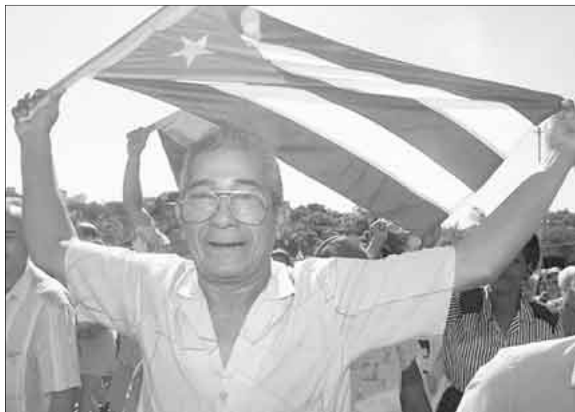
Cubans demonstrate against Cuba being added to a US list of countries that "violates human rights" April, 2004.

Those Iraqi religious divisions may lead to war. Remember the religious wars in Europe.