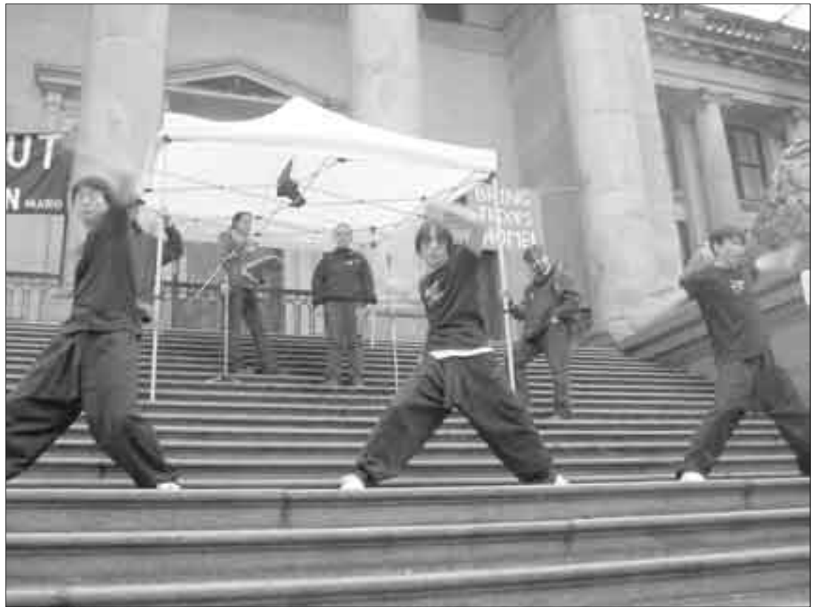
The Korean Students Network Against War performing at MAWO rally against the inauguration of George W. Bush, January 20th 2005.