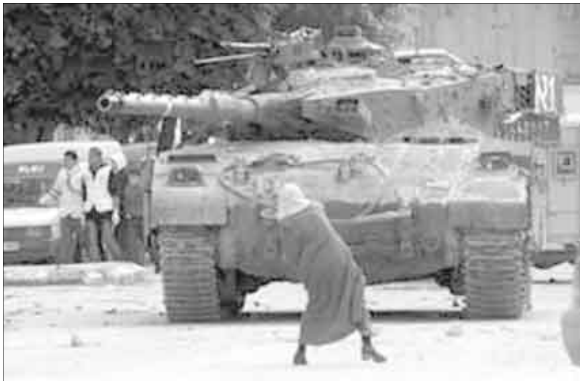
Palestinian woman throwing rock an an Israeli tank.

Significantly, the most burning issues of the 'Israeli-Palestinian conflict' were not discussed at all, those