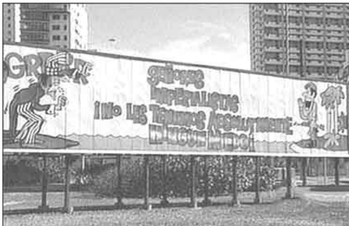
“Hey imperialists, we're not afraid!” Billboard in Cuba.

But fascism was rejected by most people. And resistance to Nazism arose in many places. Our Yugoslav brothers and sisters offered heroic resistance in that