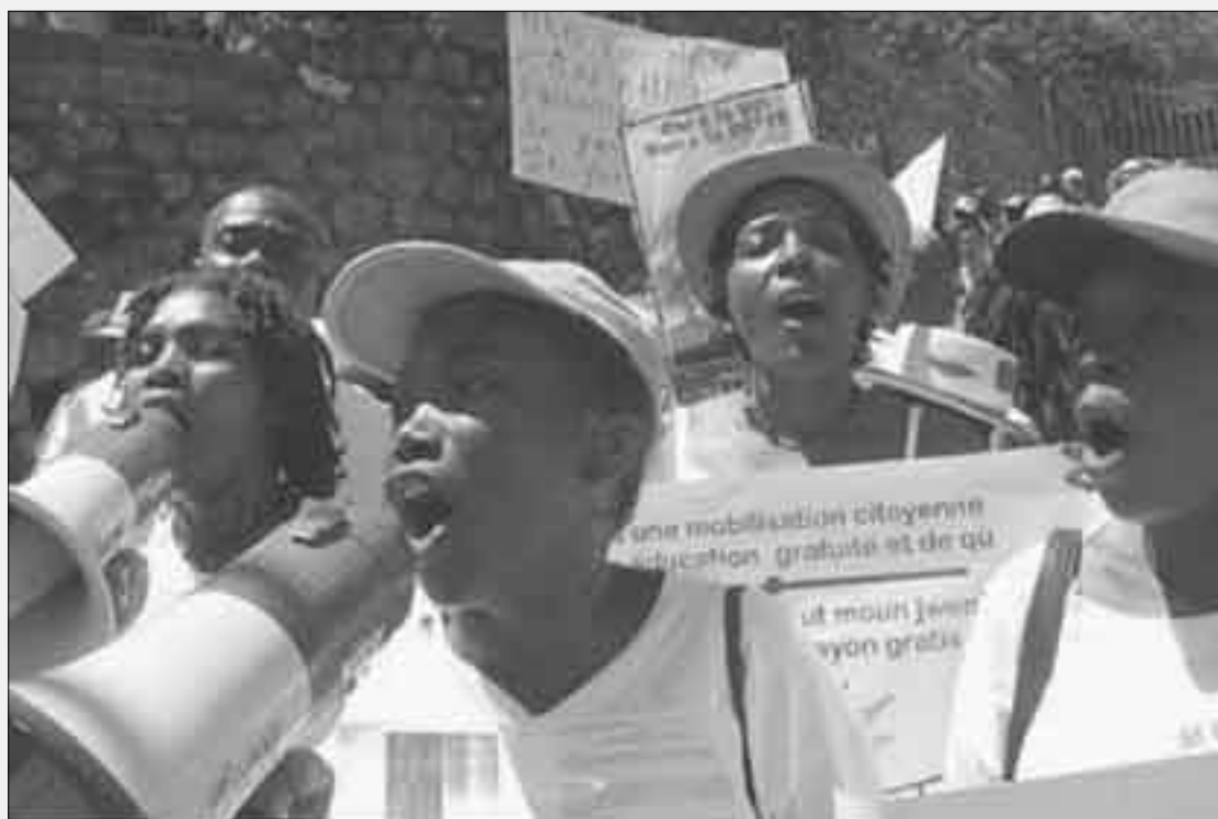
Women in Haiti protesting against the Latortue government.

The government of Jean-Bertrand Aristide implemented modest social reforms for the poorest people of Haiti. It promised more. It enjoyed the support of the overwhelming majority of the Haitian people, and its existence embodied the deep aspirations of that people for more radical and far-reaching reforms. Quite simply, a people engaged