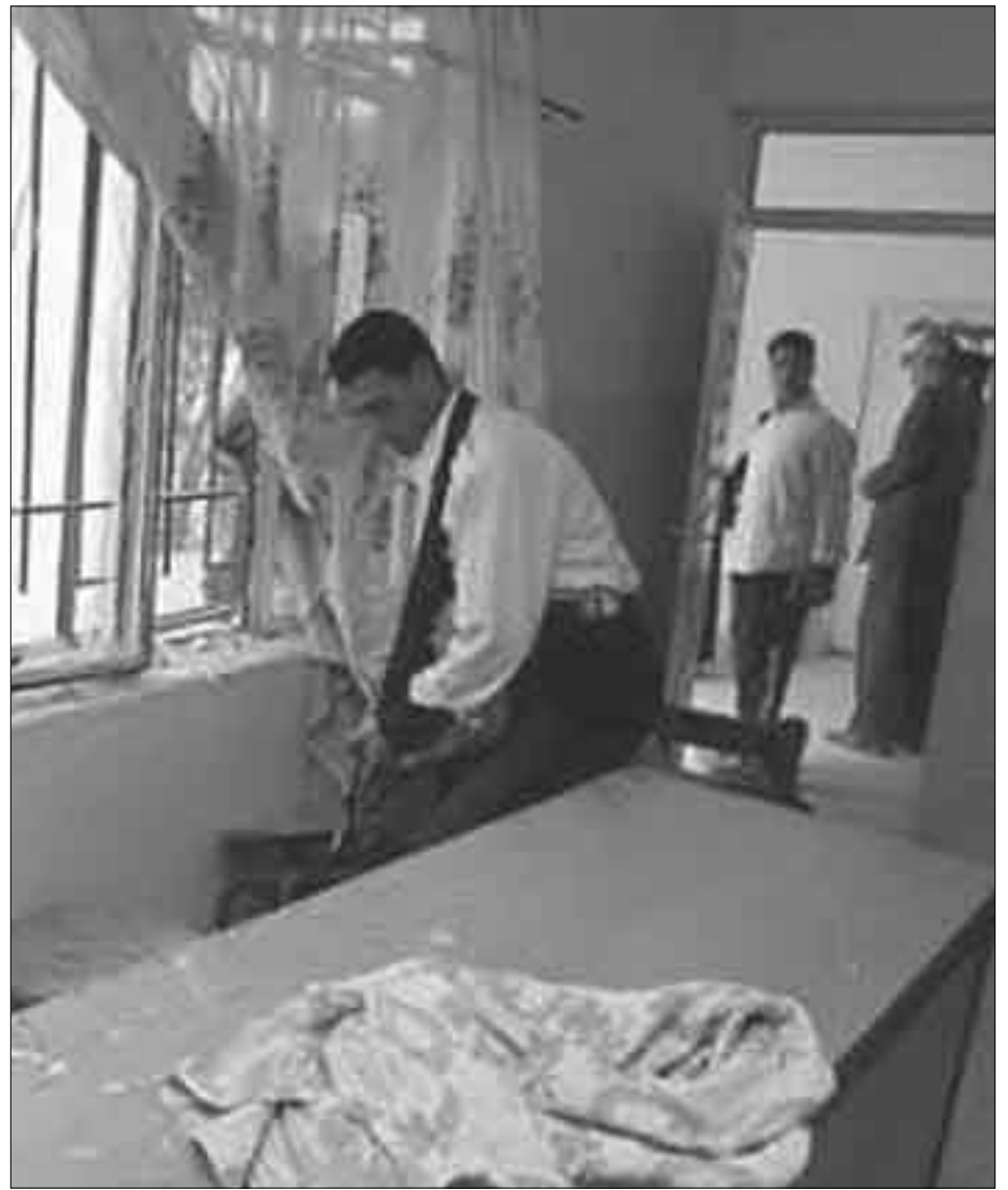
Basra election room after an anti-elections attack.

The US appointed Prime Minister of Iraq, Iyad Allawi, who made a name for himself by publicly asking the US to bomb Fallujah, came in a distant third place in the elections with only 40 seats, or 14% of the vote. Back in October when the US first began confidently