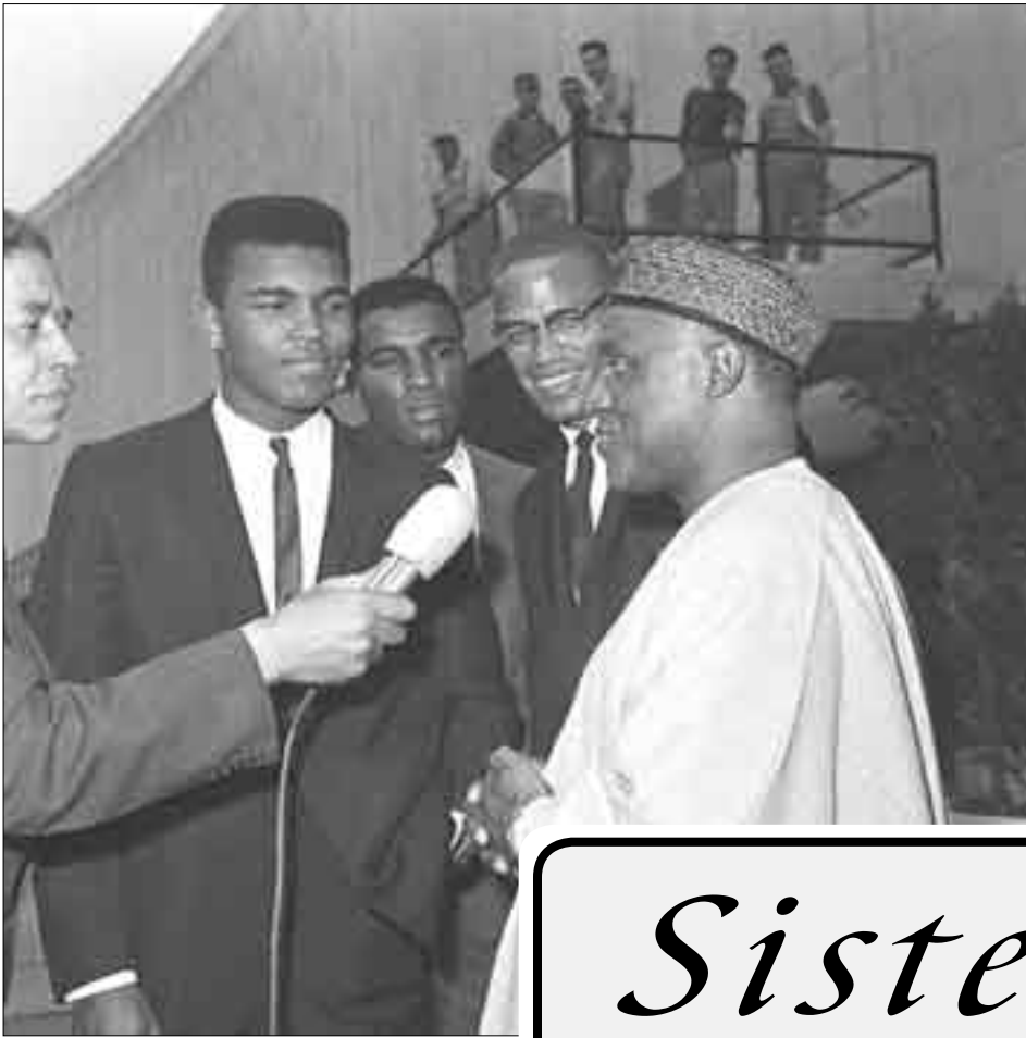
Malcolm X and Muhammad Ali.