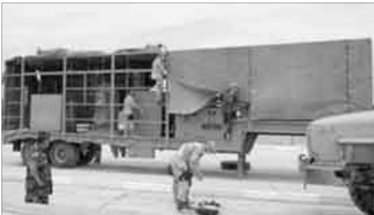
US soldiers search a suspected mobile weapons lab near Mosul May, 2003.

The justification that US imperialism offered for invading Iraq, the threat of WMDs, was hypocritical and illogical in the first place. Firstly, if there was a sincere concern that Iraq had WMDs and was willing to use them, why would the US invade? Wouldn't the presence of a huge foreign imperialist military encourage the use of whatever weapons were available? Secondly, the US possesses