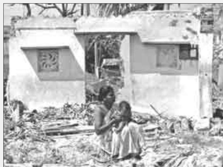
A woman and her child sit by the remains of their home, Sri Lanka, January 2005.

Contrary to this racist assessment of South Asians as being inferiorly developed as human beings, understanding the colonialism and imperialism of Western nations is key to understanding the poverty. Most of the countries hit are recovering from centuries of direct colonial occupation. Bangladesh,