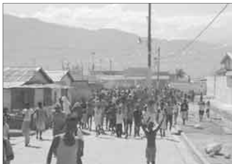
Protest in Cite Soleil, Haiti, against attack on Haitians by UN troops, January 2005.

No to Occupation of Haiti! Sovereignty for Haiti Now! Canada Out of Haiti!