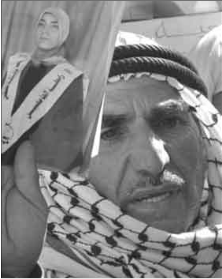
A Palestinian holds up a picture of a relative held in an Israeli prison during a demonstration in Hebron demanding the release of Palestinian political prisoners, February 14th 2005.

the entire Israeli settlements in the West Bank. Encouraged by Sharon explicitly when he was foreign minister in 1998, there are a total of 105 outposts in the West Bank that have gone up in the last decade. Out of these, the Sasson report found that only 24 could be confirmed as being established since 2001, making up less than 1 percent of the total settler population in the West Bank. According to the report, most were still receiving funds from the Israeli government for infrastructure in order to consolidate these settlements.