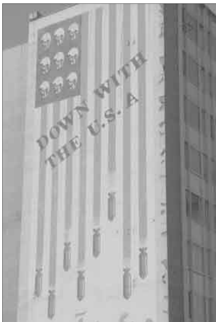
Mural in Tehran.

Rice have been meeting with leaders of the European Union (EU) and leaders in the Middle East region to discuss "how to deal with Iran".