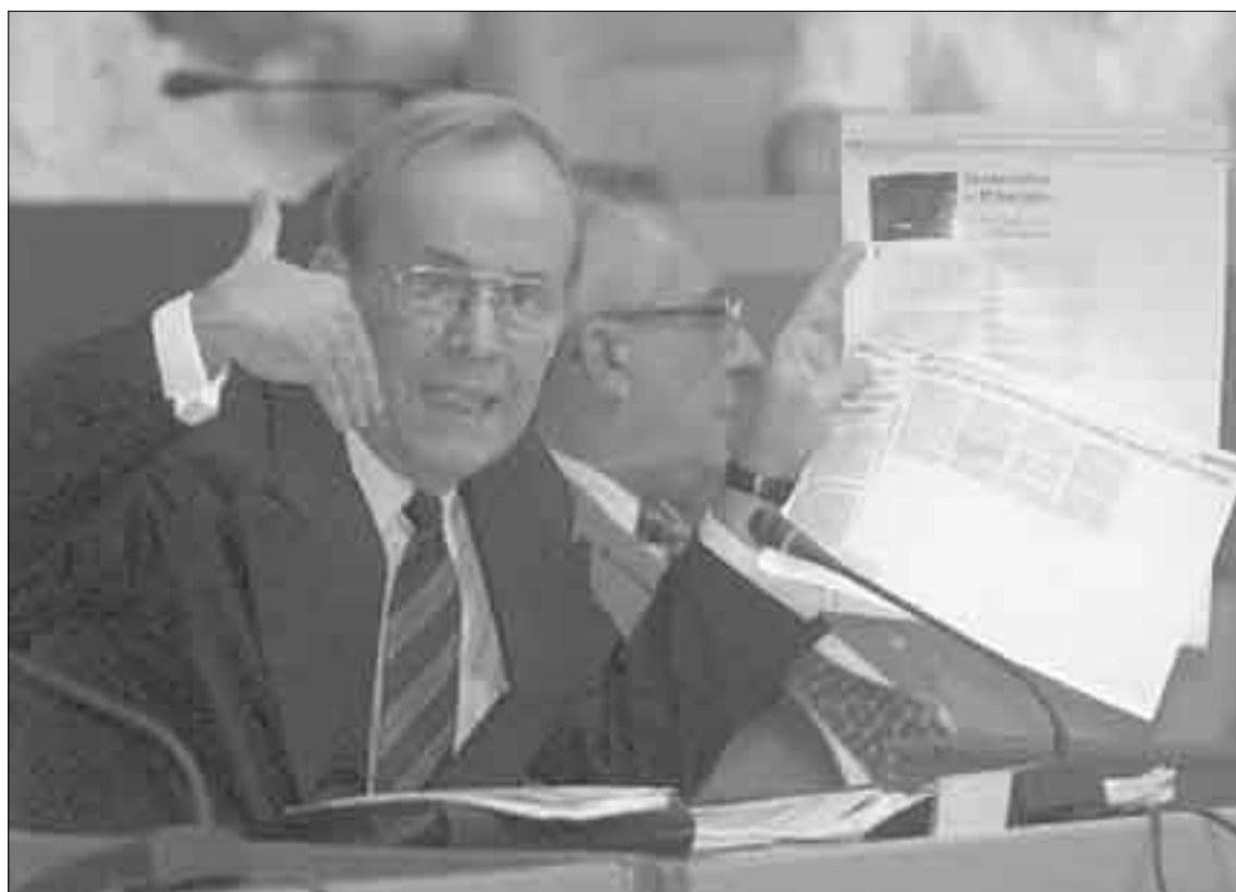
Ricardo Alarcon speaking in Cuba.

Alarcon: American propaganda machinery excels at manipulating elections. I remember a group of U.S. legislators trying to play a role in guaranteeing fair elections in the Ukraine. Remember the recent contested elections there? At the same time groups in the U.S. were demanding the right to review votes in Ohio, or trying to get recounts because of claims that there were voting violations there. I don't remember a single U.S. senator going from Washington to Cleveland or Cincinnati to see what was happening, but they went all the way to Iraq. Remember the 2004 referendum and elections in Venezuela. A number of U.S. politicians and the U.S. media got very concerned with fair voting in Venezuela but not in their own states. If they were to apply to U.S. elections similar standards to those they applied to Venezuela, my god, in Venezuela even the