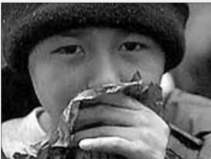
An Innu youth huffing gas.