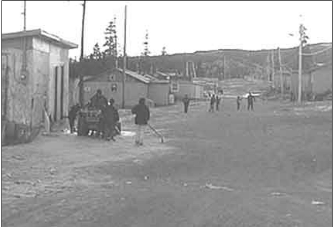
Innu Reserve at Davis Inlet.

Not only were the Innu suddenly cut off from their traditional territory and way of life, but living conditions rapidly deteriorated when the government of Canada abandoned its promises of helping them. Living in cramped living spaces without