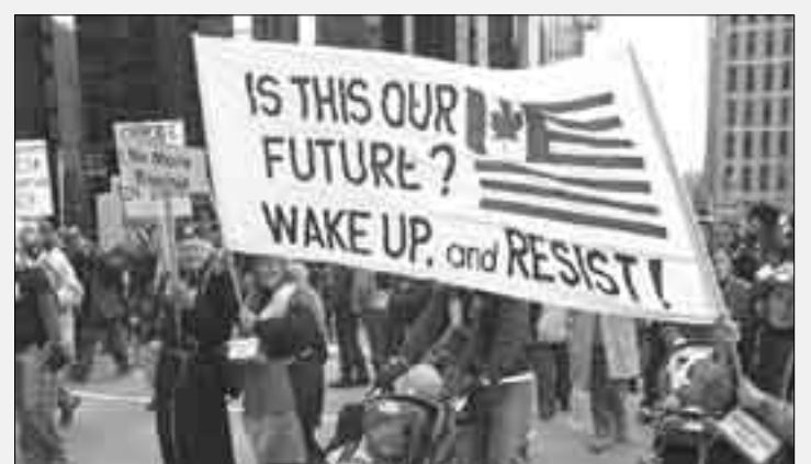
Protest against George W Bush in Ottawa, November 30th 2004.

In this spiraling era of war and occupation where the attacks of imperialism are being sharpened, the left has the responsibility of responding to these attacks through a clear focus and demands that clearly represent the interests of oppressed people, and the struggle for freedom and humanity. Following the interests of the Canadian ruling class, the Canadian