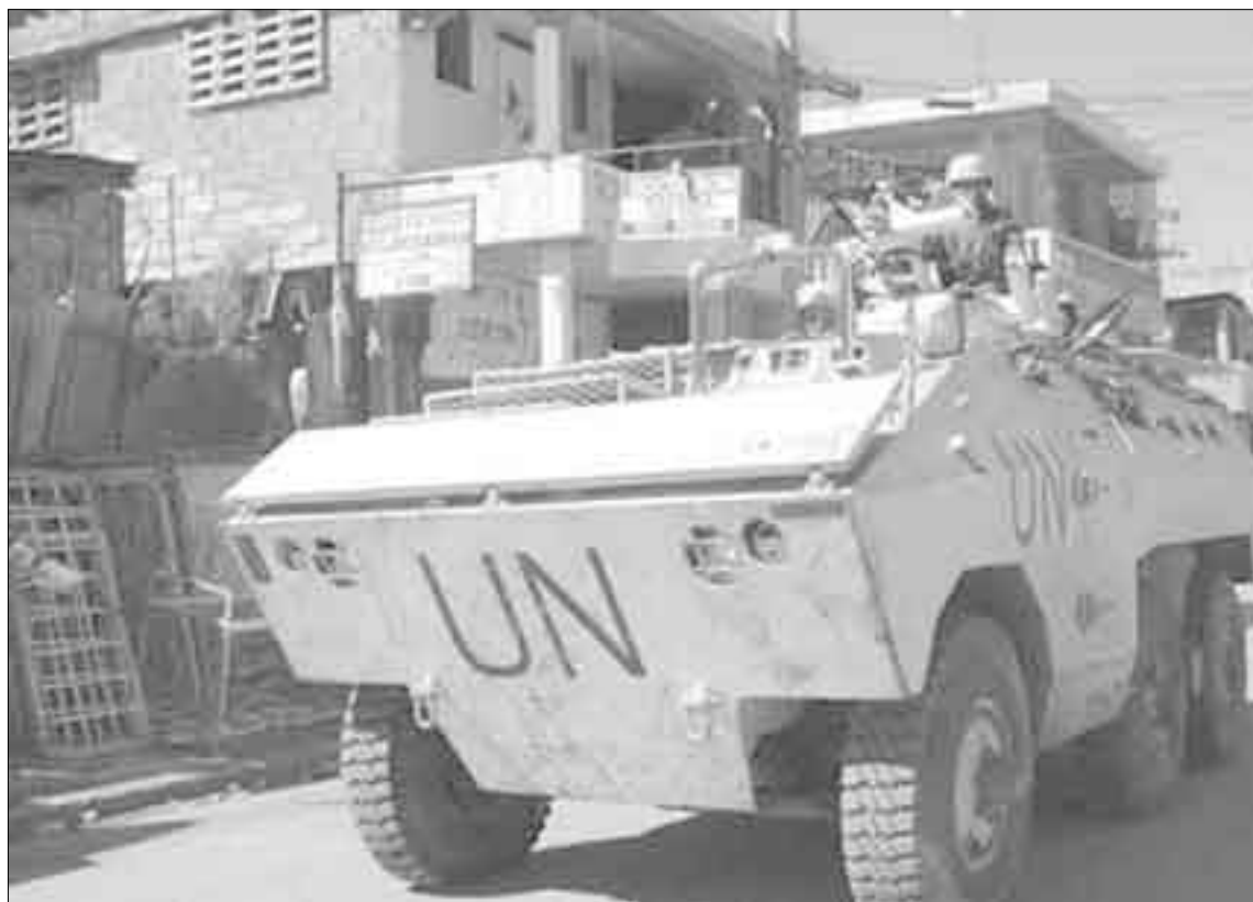
UN occupation forces in Haiti.

police and rightist gangs in action and their dead victims lying in the streets of the poor neighborhoods, often for days on end. Several thousand people have been killed in the past year at the hands of the rightists and their coup regime. Many of the poor neighborhoods of the capital Port-au-Prince cannot easily access food, water or health services because those who venture in or out become targets of the police. Hundreds of Haitians languish in prison in gruesome conditions with no charges or due process of law.