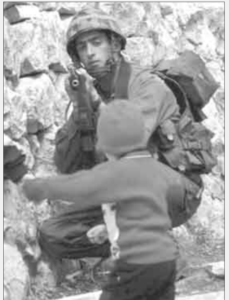
Israeli soldier pointing gun at Palestinian child, March 8th 2005.