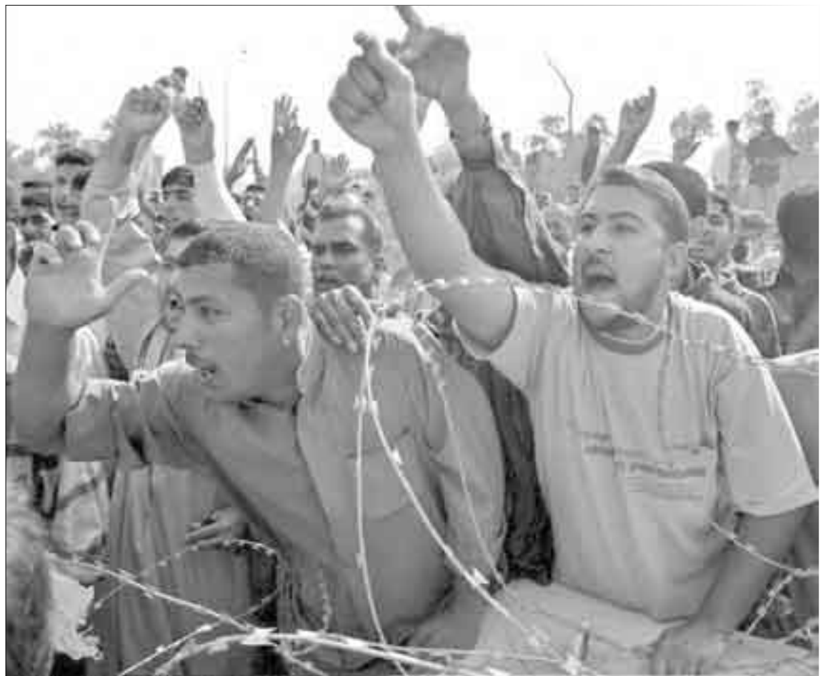
Anti-US Demonstration in Basra, February 27th, 2005.