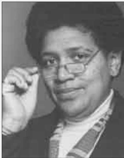
Audre Lorde (1934-1992)

Audre Lorde was one of the first American poets to advance a strong Black and feminist identity in her work. She was a deeply influential and powerful poet who re-defined the relationship of poetry as art to social and political movements in the US and around the world.