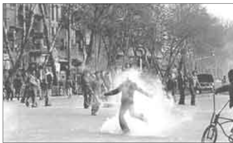
Protestor kicking tear gas during Iranian revolution.

Currently the EU is considering offering "economic rewards" to Iran if they abandon their nuclear program. One aspect that is "on the table" and being considered by both the US and EU is that of sanctions. The UN and US have been known to push sanctions as a means of achieving economic and political ends. As we saw in Iraq, UN sanctions have a far more devastating effect on working and oppressed people than they do on the ruling-class within the countries they are imposed on. Such was the case in Iraq where people suffered under sanctions for over 12 years without access to food, water, or medicine. The sanctions on Iraq led to the deaths of more than one and a half million Iraqis. According