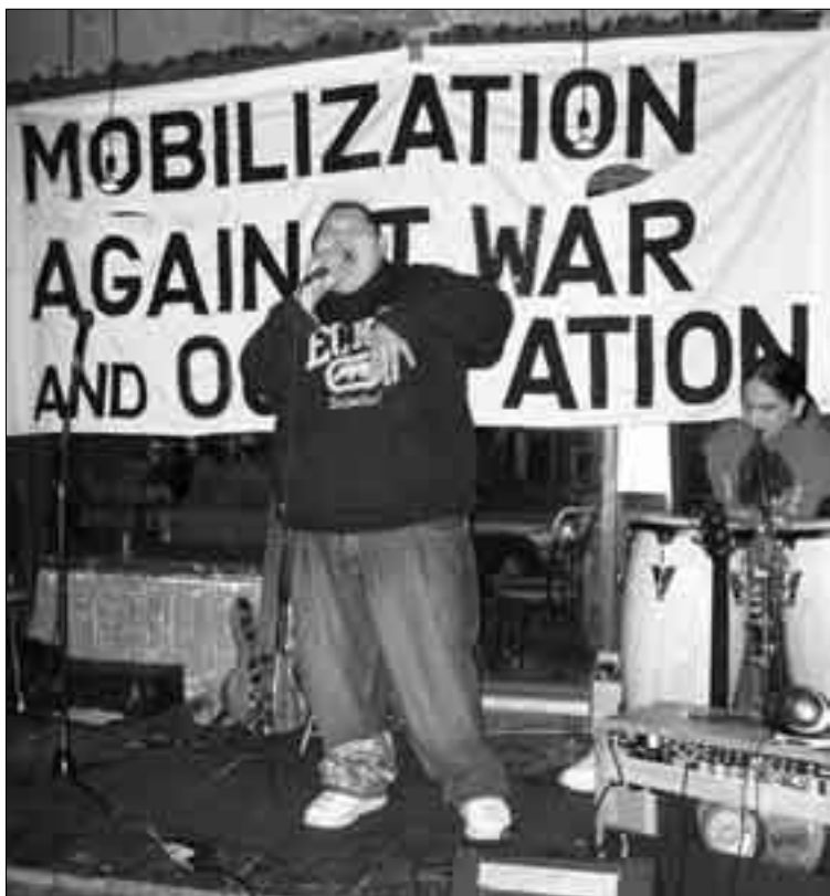
The Obese Chief performing at MAWO fundraiser on March 5th, 2005.

Because war and occupation brings the flow of people's daily lives to a halt and puts them in a situation where they are fighting for survival everyday it also brings the