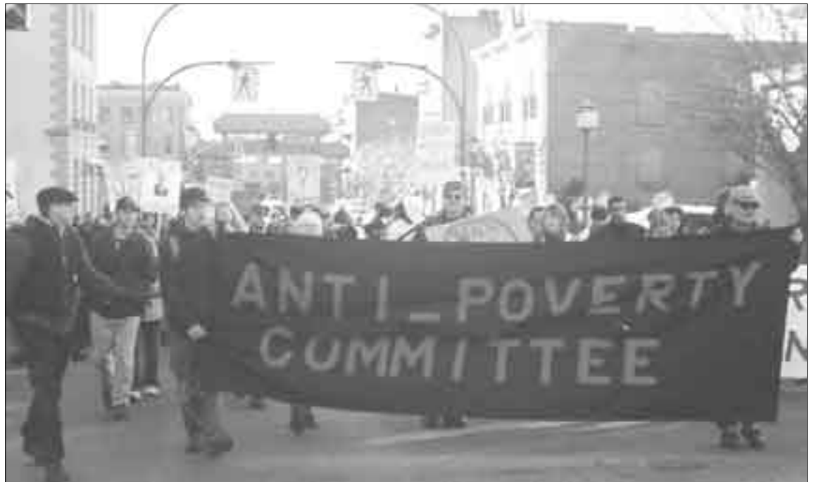
Anti-Poverty Committee Demonstration against Throne Speech at the BC Legislature, February 15 th 2005.

As the Liberals attacked, and continue to attack homeless and deeply impoverished sectors of society with one hand, they have been chipping away at the stability and standard of living of working people with the other hand. Over 20,000 jobs have been eliminated from the public sector and contracted out. As well, when first in office, the BC Liberals introduced a new $6 an hour minimum wage for first-time workers. The impact of this has meant a lowering of the bar for all working people and a reduction in available, stable, and decent