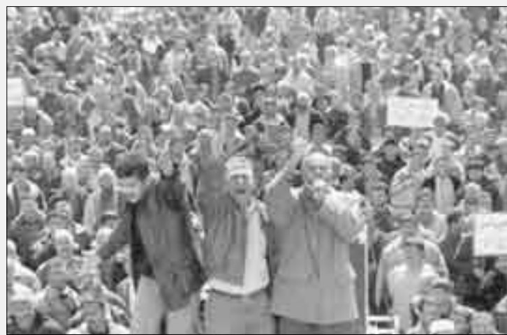
Unemployed Palestinian workers demonstrate in Gaza, March 13th 2005.

Israel has translated into forcible attempts to 'Judaize' the Galilee, the Triangle, and the Naqab and the further expropriation of roughly another one-million acres of Palestinian land. While Palestinian land ownership stood at 94% of what became the Israeli state of today, this number was reduced to 3% of all lands in this policy