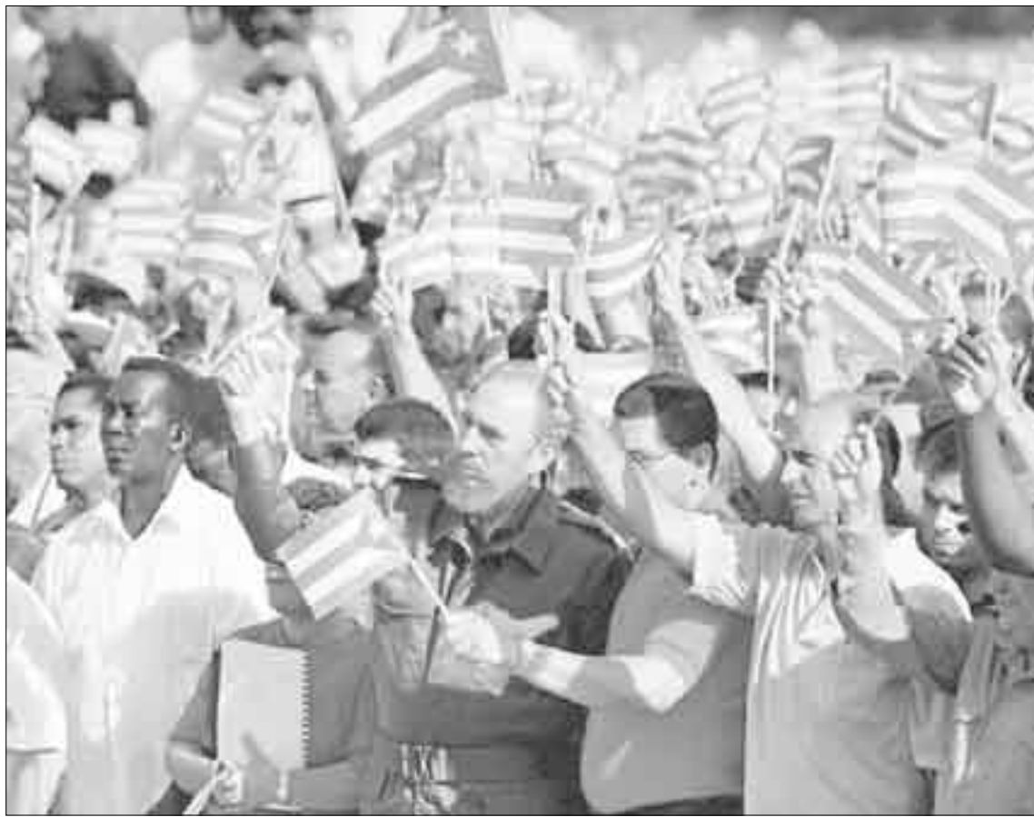
Cubans celebrate the anniversary of the July 26th Attack on the Moncada barracks, July 26, 2000.

Our answer was simple. We cut off contacts with the embassies here. We said we are prepared to wait the necessary time. On a personal basis, I enjoyed this period. It's a burden to attend these diplomatic functions like receptions and diplomatic dinners if you have work to do. Of course, we continued as before normal functions with African, Asian and Latin American embassies in Havana. But now the Europeans realize it was nonsense and are changing. But more important, I said that Europe had followed Spanish advice. That was when Mr. Aznar headed the conservative government in Spain. In March, Spaniards elected a new government, which withdrew Spanish troops from Iraq, and proposed other progressive steps on women's rights, etc. And regarding Cuba, the new government openly said it wanted to change the Aznar policy. The socialists have a more respectful and friendly approach. That was the source of Europe's new position. Let's hope the EU will follow the new Spanish counsel. By the way, it's as if we're still a Spanish colony, which we're not. But I think we've turned the