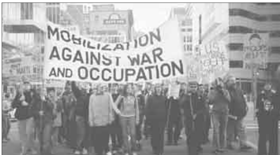
Mobilization Against War and Occupation march, February 26th 2005.

Led by banners, signs and the chanting of hundreds the rally marched into the streets of downtown Vancouver chanting, "US/UK