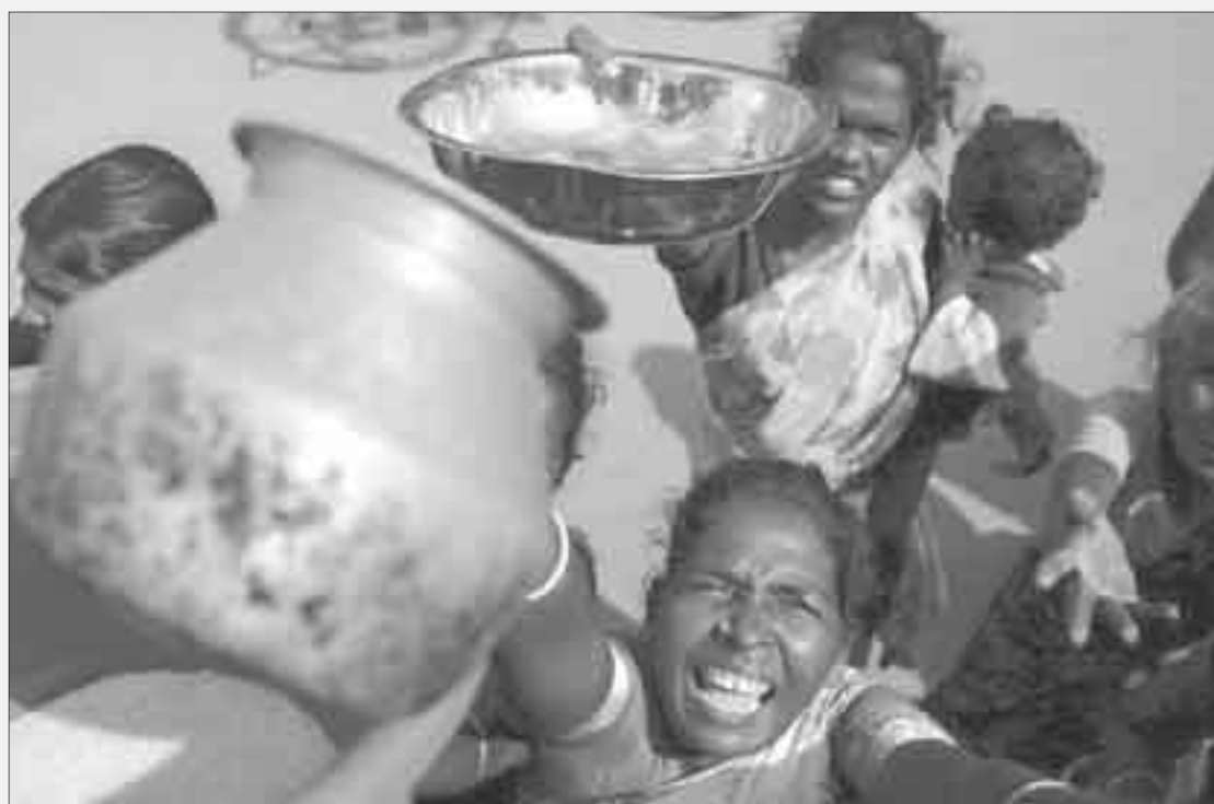
Tsunami victims struggle to have access to clean water.

According to the World Bank, South Asia, with a Gross National Income per capita of $460 for its 1.4 billion inhabitants, is home to nearly 40 percent of the world's poor living