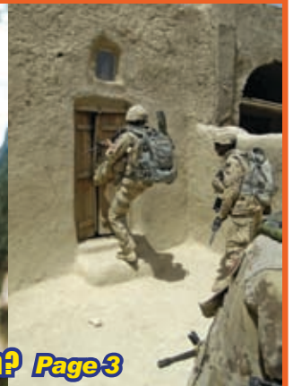
What is Canada doing in Afghanistan? Page 3