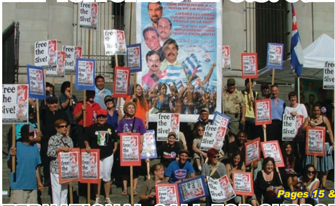
Pages 15 & 38