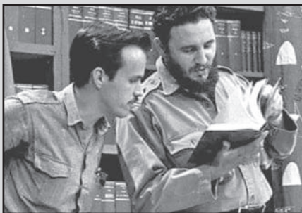
Ricardo Alarcón with Comandante Fidel Castro in the early years of the Cuban revolution