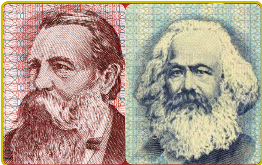
Marx and Engels, the Founders of Scientific Socialist Thought